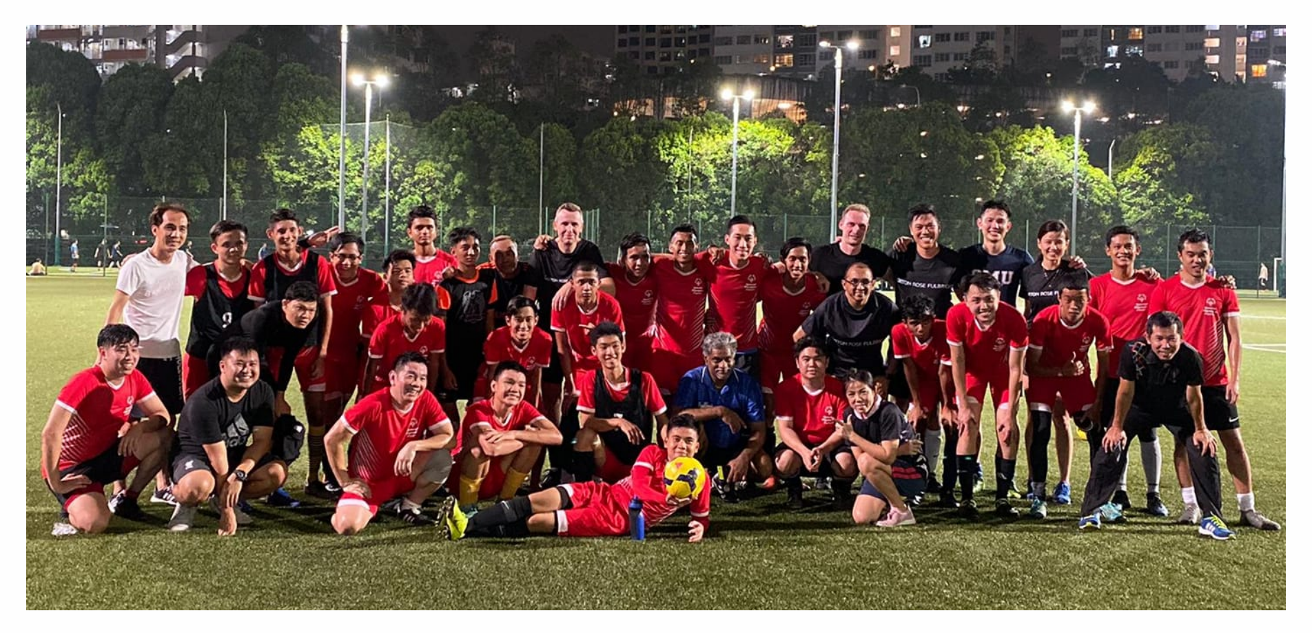
Playing 11-a-side Friendlies