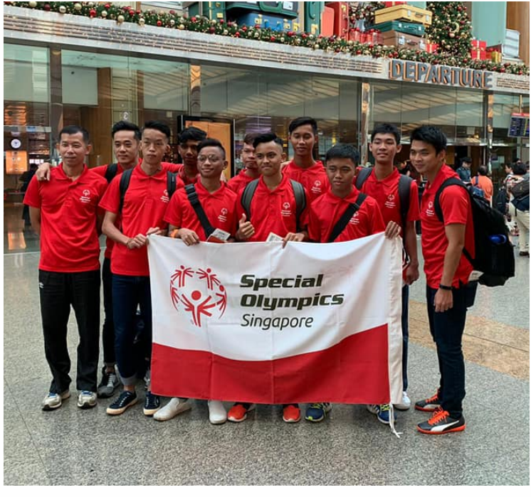
Meeting the Legends