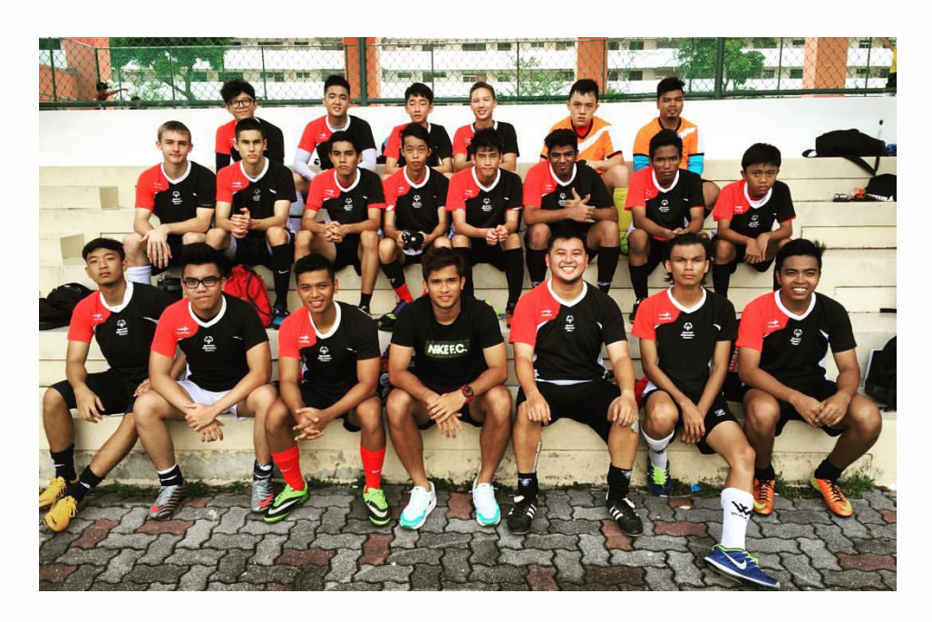
Consistent Training Programme